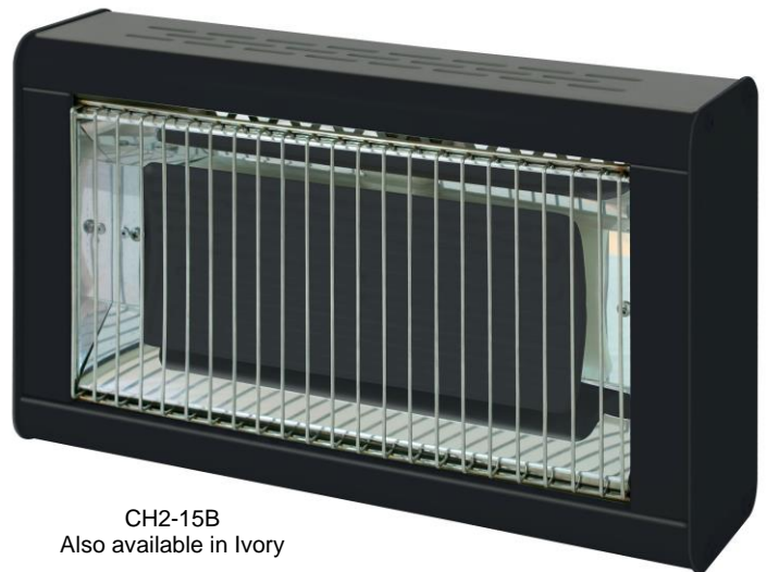
CH2-15B Also available in Ivory