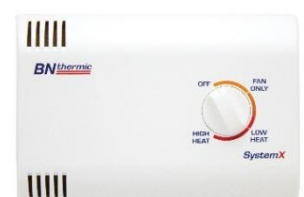
CX2 Wall Controller