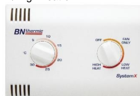
CX1 Wall Controller