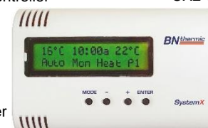
CX6 Wall Controller