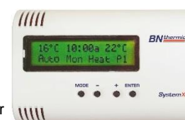
CX6 Wall Controller