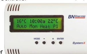
CX6 Wall Controller