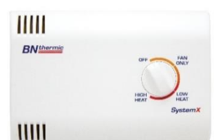
CX3 Wall Controller