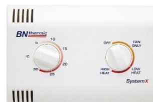
CX1 Wall Controller