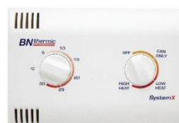
CX1 Wall Controller