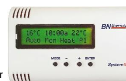
CX6 Wall Controller