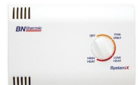
CX2 Wall Controller